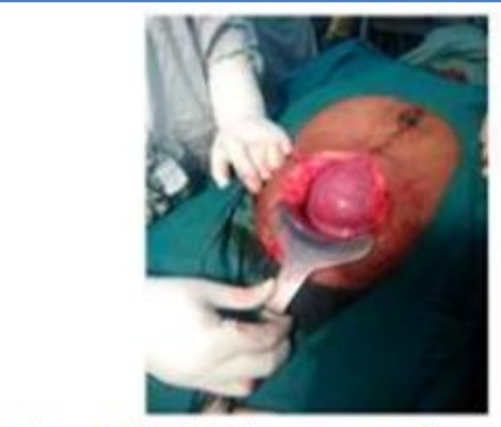
segment of Gravid Uterus (Hidering uterine Incision during cesearian Delivery)