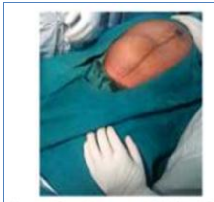
(Visible Per abdomen)

operative period was uneventful. Sutures were removed on 8th post-operative day and patient was discharged and fallowed up post operatively.